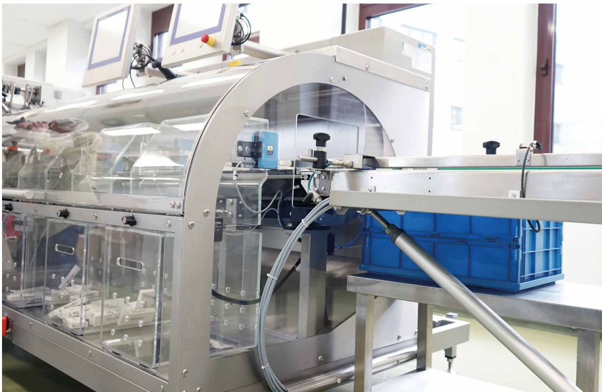
4-in-1 solution for highest process safety

In addition to the PCE Line Manager direct, to ensure comprehensive production line management, PCE Site Manager will in future provide all information about the production process, such as production output, product and packaging quality, and coding. PCE Site Manager can be connected directly to the Krewel Meuselbach production database and provides those responsible for quality management with valuable information from multiple