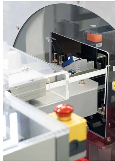
The precise product guidance of the XS2 MV TE system facilitates smooth product flow.

production lines at both production sites when necessary.