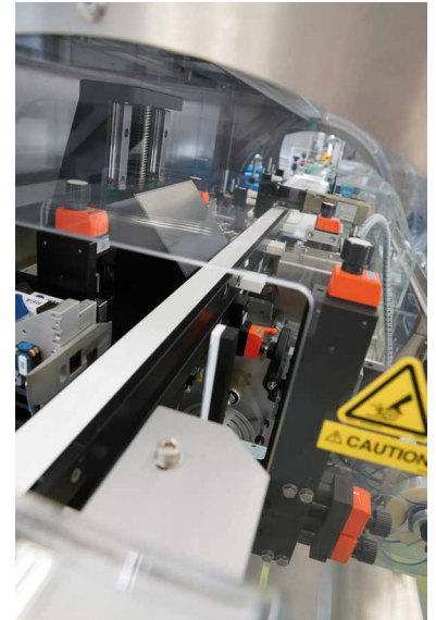
Its diverse range of applications and compact structure make the XS2 MV TE from METTLER TOLEDO a truly impressive piece of equipment.

The XS2 MV TE combines precise weighing, marking, sealing, and verification with global requirements for traceability and the prevention of product falsification – even meeting the market requirements of the future. This is especially important for a pharmaceuticals manufacturer like Krewel Meuselbach, which produces goods in line with EU Directive 2011/62/EU and the GMP standard, and markets its products on an international level.