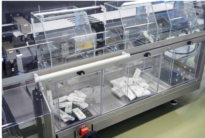
Rule out pharmaceutical counterfeit by serializing, sealing and weighing

Krewel Meuselbach GmbH offers a complete range of high-quality pharmaceutical products in the key areas of depression/central nervous system, pain relief, and cold and flu treatments.