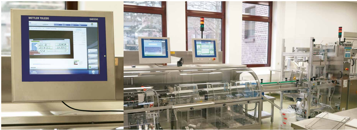
All the latest data can be retrieved immediately on the clear operating terminal.

need to be protected against falsification and clearly identifiable. We are already meeting these requirements," Hilmar Höhne goes on to explain.