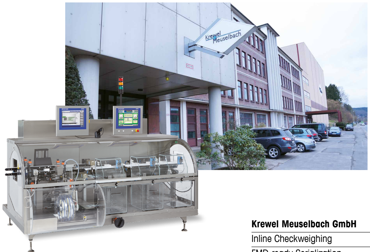
XS2 MV TE

At the Eitorf site, Krewel Meuselbach uses the compact XS2 MV TE system from METTLER TOLEDO in a thermoforming line to ensure comprehensive quality control and prevent the falsification of its products. It achieves this through data matrix codes and tamper-evident seals.